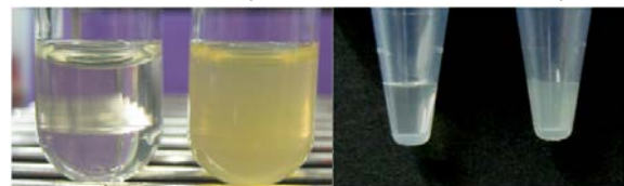
Color sample for chylous sample: 1,000FTU